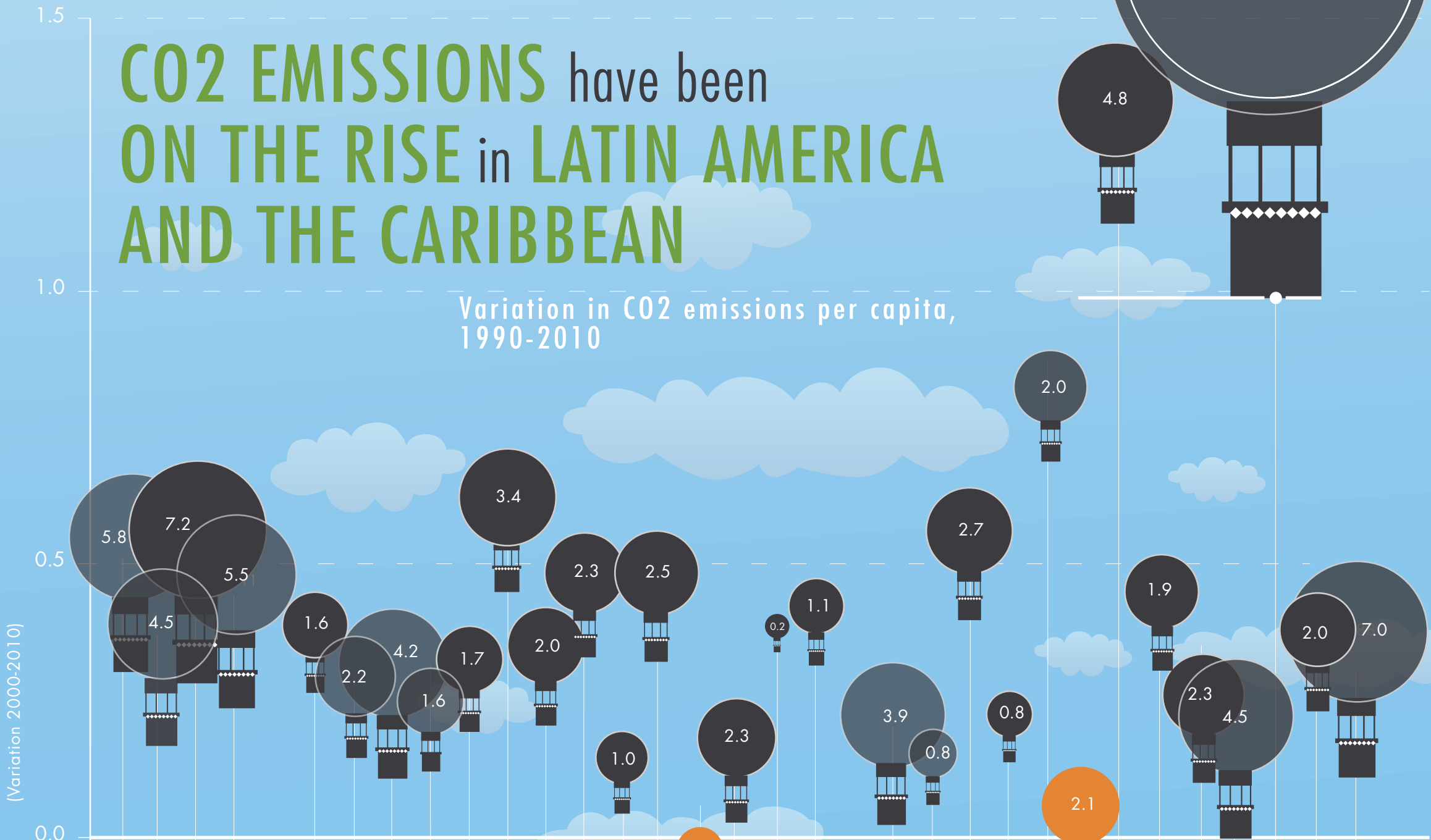
Variation in CO2 emissions per capita, 1990-2010

Only four countries show a downward trend between 2000 Y 2010: BELIZE, GUATEMALA, JAMAICA AND DOMINICANAN REPUBLIC